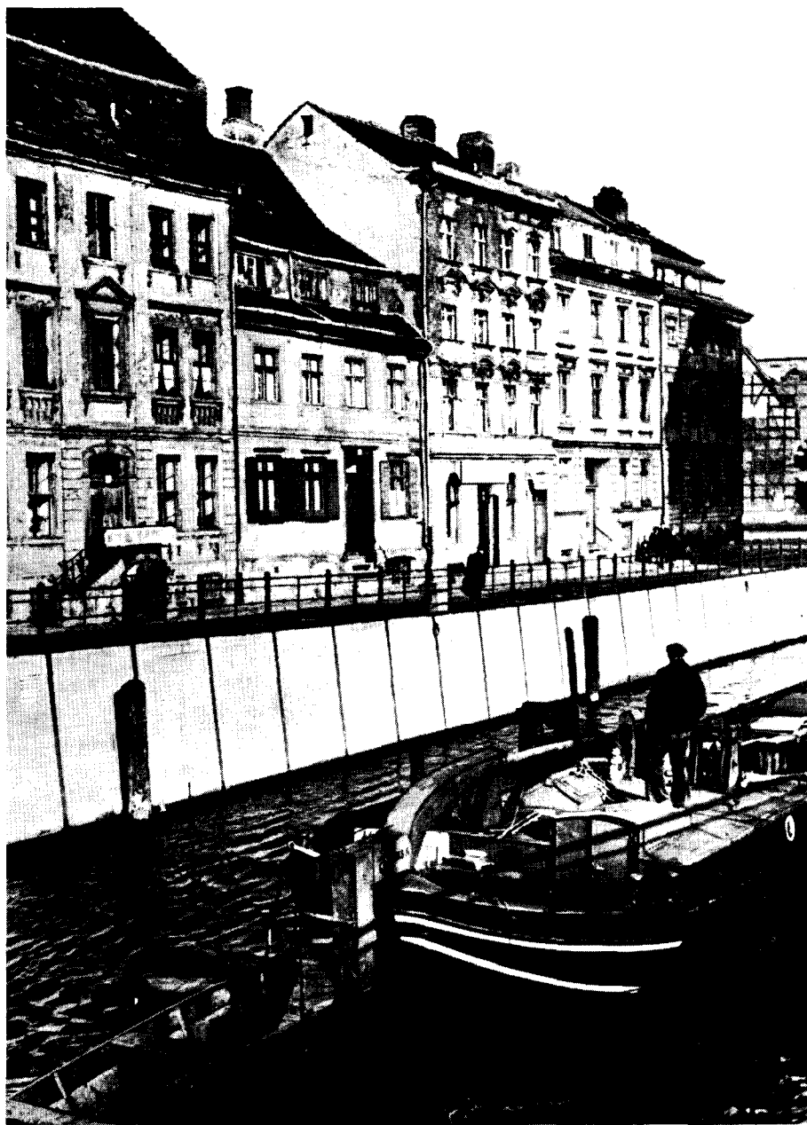
Amid political rumblings, East-Berliners remain quiet, go about their daily chores, and hope for the day when their land can once again be joined to a powerful, revitalized New Germany!